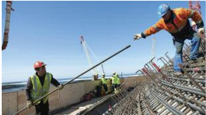
Figure 4: Reinforcement being fitted to the reactor dome at Olkiluoto 3 (May 2010) 64 .

section of the steel liner, a 14m-high dome, was fitted to the reactor building in September 2009. Once the welding was complete, this provided a weather-tight seal to the reactor building that allowed the internal work to proceed 61, 62 . Currently the construction work is continuing with the dome of the reactor being covered by a thin layer of concrete during April 2010 and it is to be followed by a thicker reinforced layer, for which the reinforcement is currently being fitted. Once this second layer of concrete is poured the inner wall of the reactor building will be completed and work will start on the dome of second, much thicker, impact-resistant wall 63 .