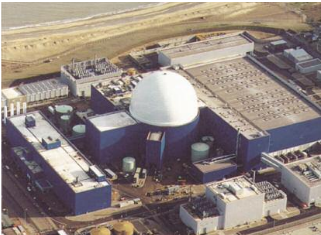
Figure 1: Sizewell B PWR

The CEGB issued an Enquiry Specification for Sizewell B in April 1980 and the request for section 2 consent and deemed planning permission to build the first of four identical stations was submitted in January 1981. They also applied to the Nuclear Installations Inspectorate (NII) for a revision to the Site licence. In March 1987, almost exactly two years after the longest ever Public Inquiry had finished taking evidence, the Secretary of State granted planning consent for a 1200MW PWR power station to be built at Sizewell alongside the still operational Magnox station, Sizewell A. Following the accident at Three Mile Island Unit 2, on the 28th March 1979, and the change of Government, the decision to build a PWR was revisited. In December 1979 the decision was taken to proceed subject to the normal assessment and licensing processes.