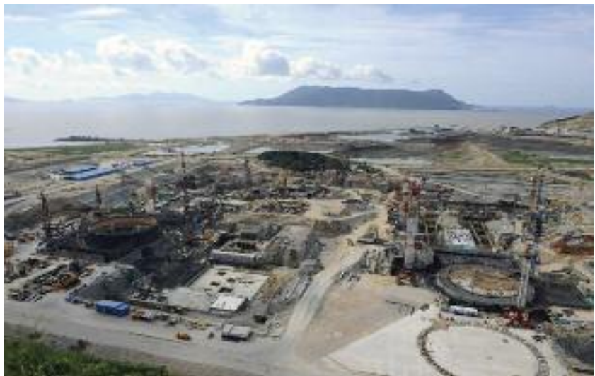
Figure 8: The EPR site in China: Taishan 1 (left) and Taishan 2 (right) in July 2010

Of note is that construction is not the only part of project delivery that sees improved performance since engineering for the electro-mechanical scope of the Nuclear Steam Supply System has seen its productivity increased by a factor of 4 between Olkiluoto 3 and the Taishan projects.