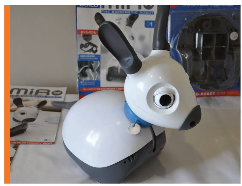
MIRO is a biomimetic robot created by the University of Sheffield that copies the behaviour of animals. It can learn from its interactions and can become loyal to its owner and respond to their voice

Developed countries are experiencing a trend in increasing lifespans and falling birth rates. In the UK, the number of elderly people is rising dramatically at a time when the ability of the state to provide social care is beset by economic difficulties as well as staff shortages. Quality of life for older people is achieved best by enabling them to remain independent in their own homes for as long as possible. Loss of independence is often the result of fairly small-scale changes: psychological factors such as confidence, a marginal reduction in mobility, or forgetfulness.