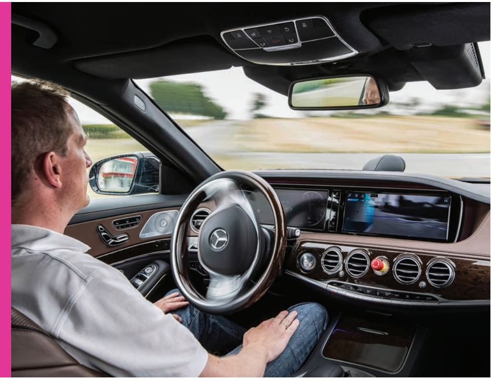
The Mercedes S 500 autonomous car uses sensors already fitted on the production S-Class to 'see' obstacles and interpret roadside information and a sophisticated route pilot to navigate the way. In September 2013 the pilot car took on traffic lights, roundabouts, pedestrians, cyclists and trams, as it navigated its way from Mannheim to Pforzheim, in western Germany

The concept of automating some of the assistive functions that could enable older people to retain their independence for longer is highly attractive