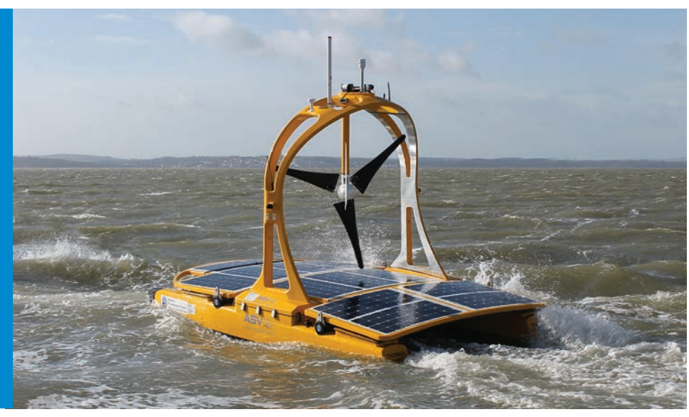
The C-Enduro is one of 50 systems developed by ASV. The autonomous marine vehicle with a self-righting hull can operate for up to three months at a time using a combination of solar, wind and diesel energy. It can be used by oceanographers for a variety of sea-going research missions and for security and defence purposes including chemical detection and anti-submarine warfare

The UK's position on autonomous vehicles is also an advantage. By not signing the Vienna Convention – which, for most countries, limits the degree to which public roads can be used for trials of new kinds of vehicle and new control systems – the UK is in a good position to host real-world trials of nextgeneration cars.