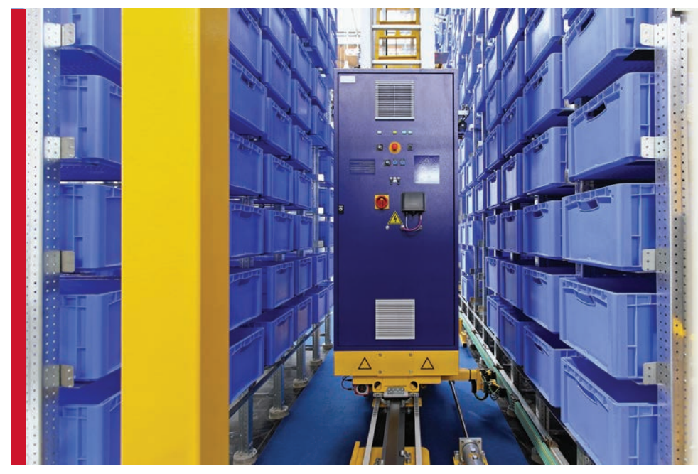
Automated warehouse storage and retrieval system

Clarke's aim, he said, was "to use robotics to add value" to the business. The intersection of the internet of things with autonomous systems, through smart devices inside smart homes, is an attraction, and there are potential new business areas to go into that could include health.