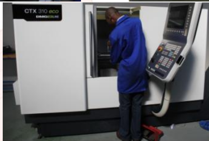
CNC Turning machine