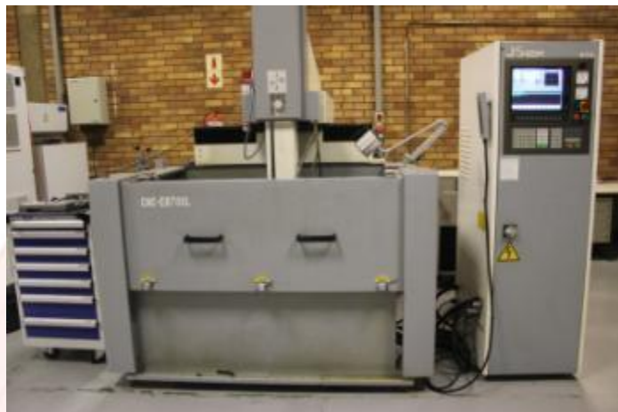
NC EDM Die Sink machine