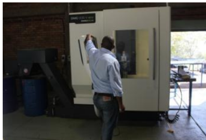
3-Axis CNC Milling machine