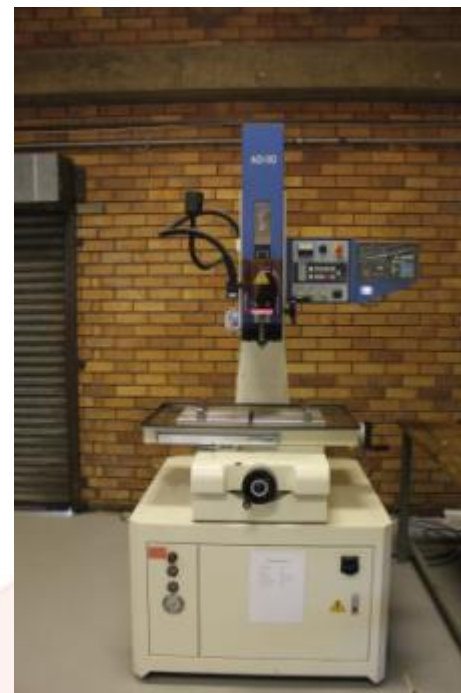
NC EDM Drill machine