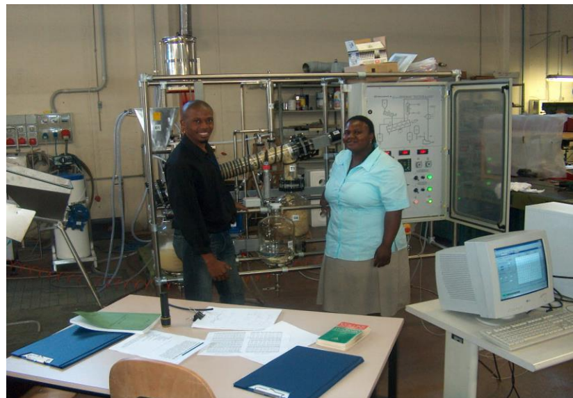
Essential oil extraction