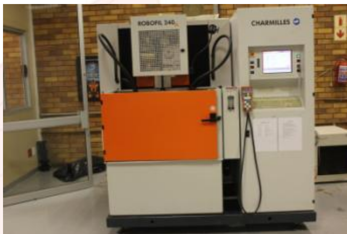
CNC EDM Wire machine