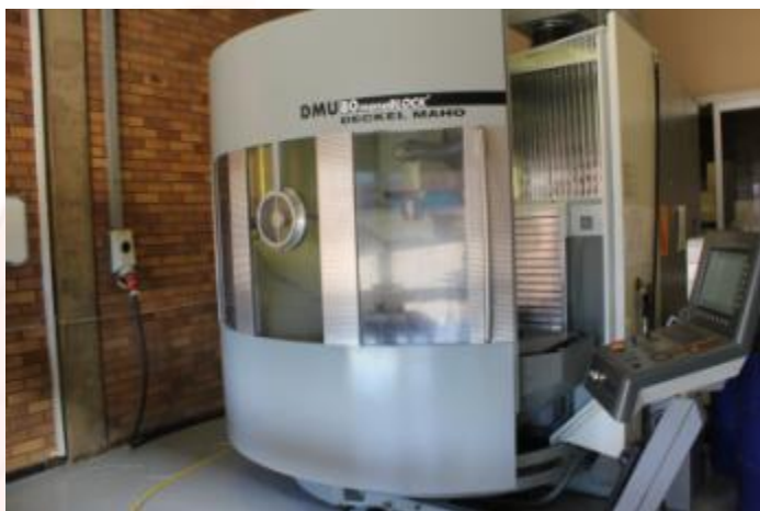
5-Axis CNC Milling machine