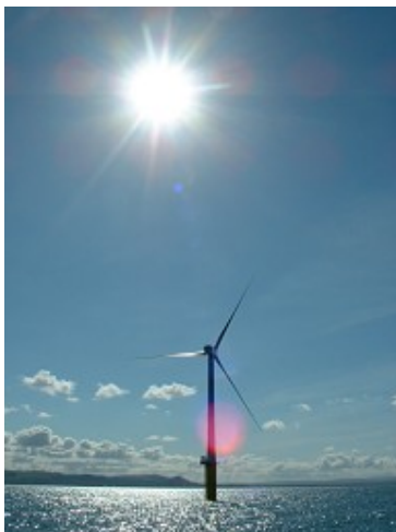
Figure 1: Wind Turbine at North Wales coast

Through the RWE Power International brand, RWE npower sells specialist services that cover every aspect of owning and operating a power plant, from construction, commissioning, operations and maintenance to eventual decommissioning.