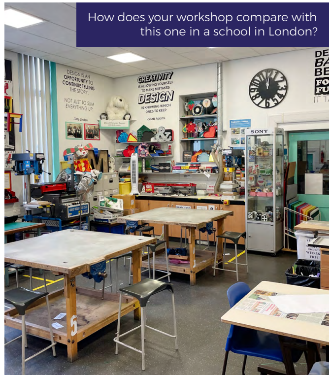
How does your workshop compare with this one in a school in London?