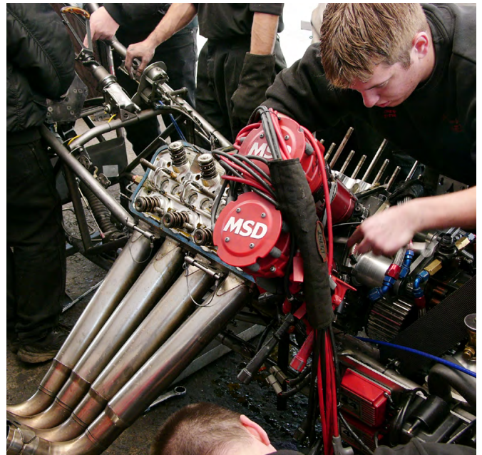
Engine bust? Who ya gonna call? Engineers!