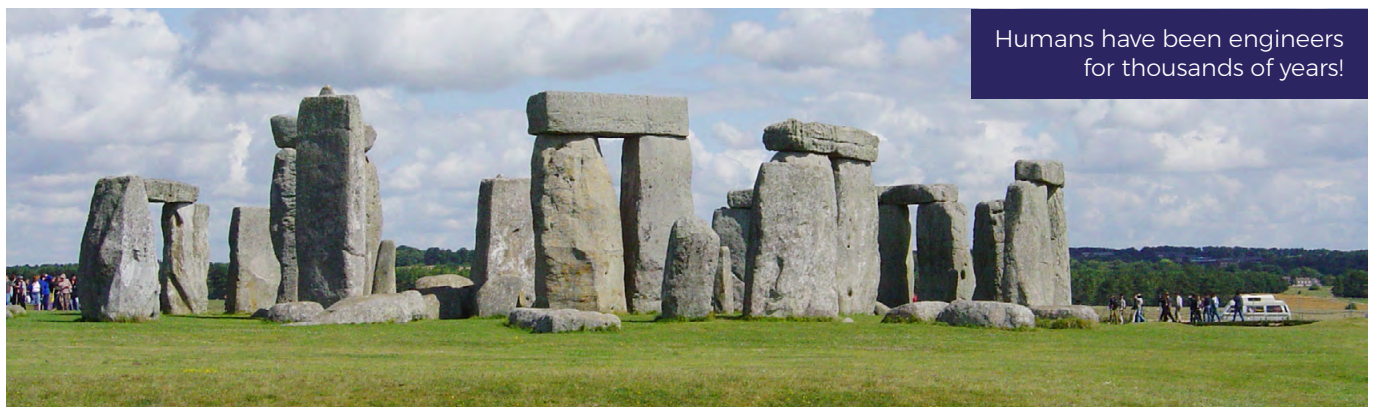
Humans have been engineers for thousands of years!