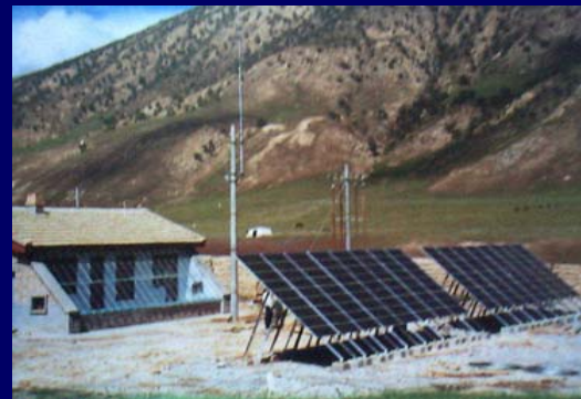
光伏发电的通信基站, 青海, 1992