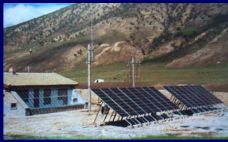
光伏发电的通信基站, 青海, 1992