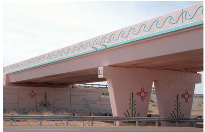
Figure-2: Bridge Beams