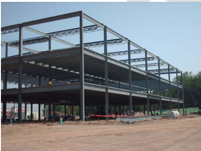
Figure-1: Steel Beams

Examples of beams can be seen in figures 1 to 3: