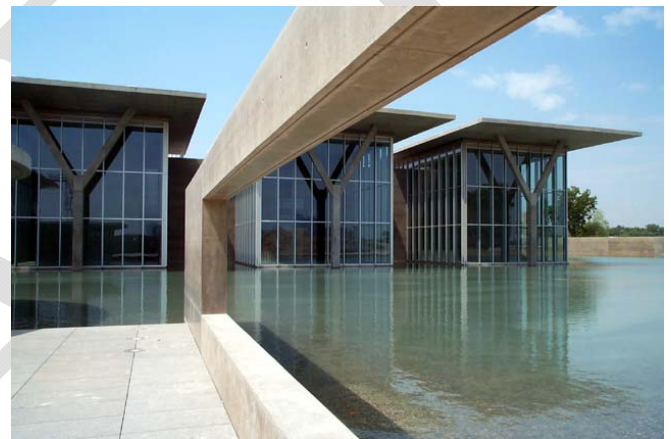
Figure-3: Reinforced Concrete Beams

In addition to the requirements for the beam to safely carry the intended design loads, there are other factors that have to be considered including assessing the likely deflection of the beam under load. If beams deflect excessively, then this can cause visual distress to the users of the building and can lead to damage of parts of the building including brittle partition dividers between rooms and services such as water and heating pipes and ductwork.